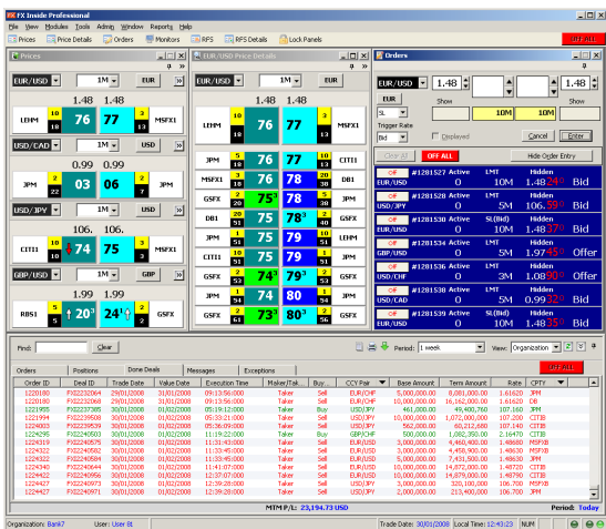
FX Inside Professional Workspace Main workspace and Deal Blotter

Integral's solutions and services are delivered On Demand so that you can quickly go live without having to set up, own and operate a costly IT infrastructure. No software to install, no migrations to plan.